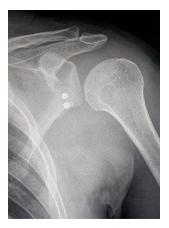
Figure 1. Postoperative X-ray control showing that the graft has perfect positioning.

Postoperatively, radiographic assessment of the coracoid graft positioning in a true anteroposterior and lateral view was performed 24 h and one month after surgery in all patients (Figure 1).