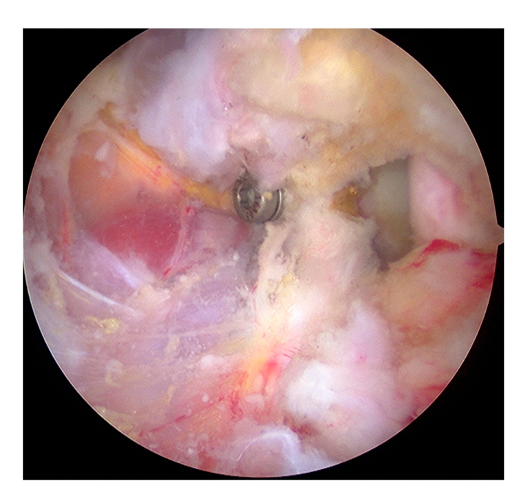
Figure 4. Final view from anteroinferior portal. Subscapularis tendon covers the proximal screw.

Two 3.5 mm cannulated bicortical screws were placed to fix the graft to the glenoid rim in all patients, except for one patient, in whom only one screw was used. The mean duration of the surgical procedure was 105 \pm 28 min (range 70–230 min).