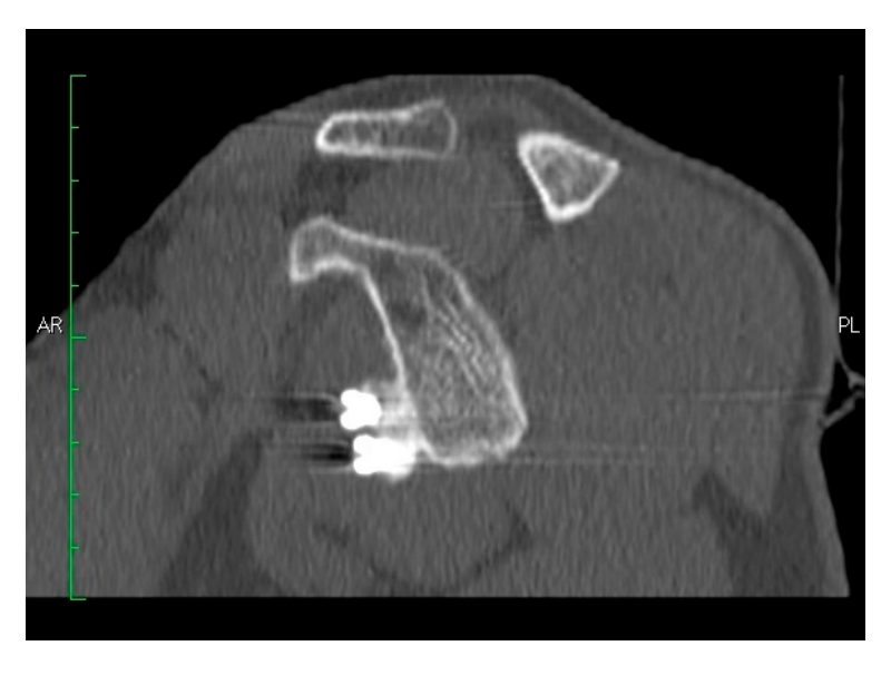
Figure 6. Sagittal computed tomography scan of a united coracoid graft.