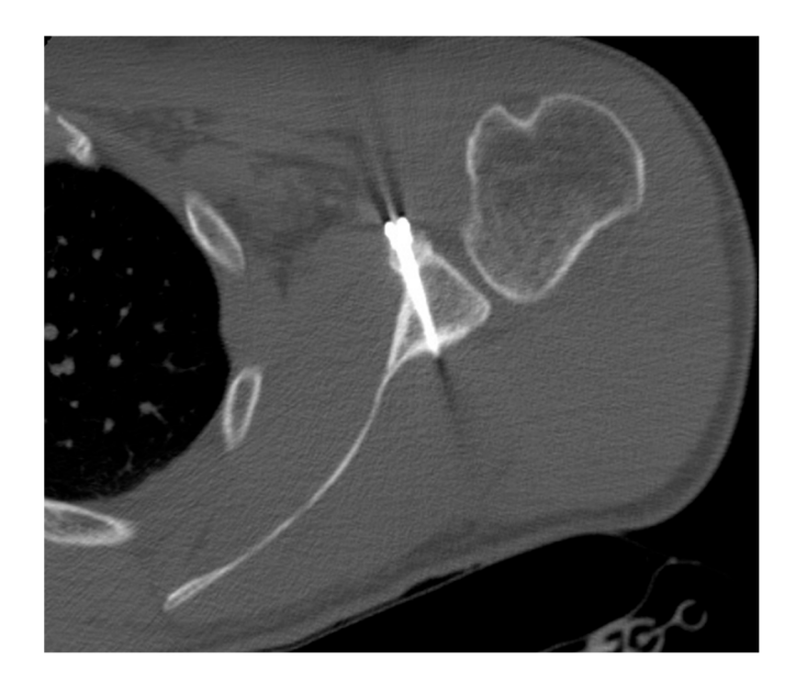
Figure 5. Axial computed tomography scan of a united coracoid graft.